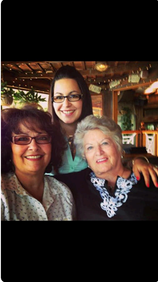
Mother's Day @ Seacrets