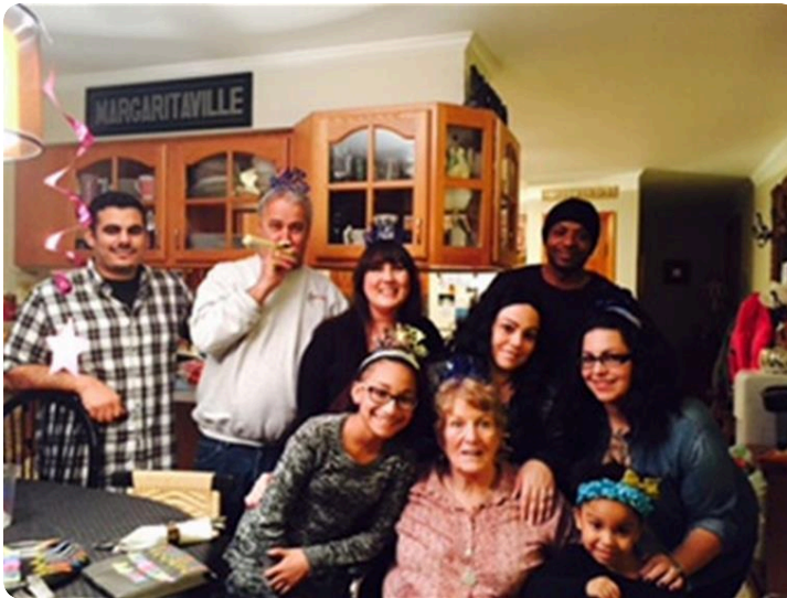
Moms 79th Birthday