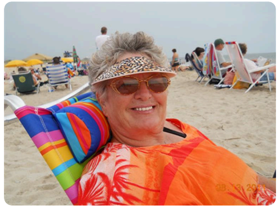
Miss that smile!